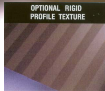
OPTIONAL RIGID PROFILE TEXTURE