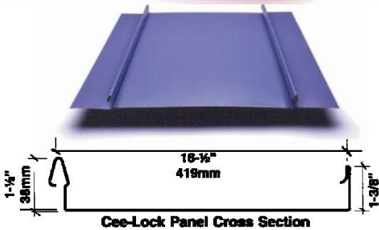
Integral Snap-Lock Seam with Patented* Vinyl Weather-seal